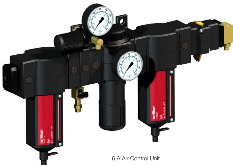
6 A Air Control Unit