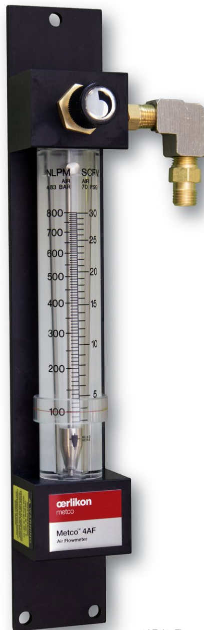
4AF Air Flowmeter