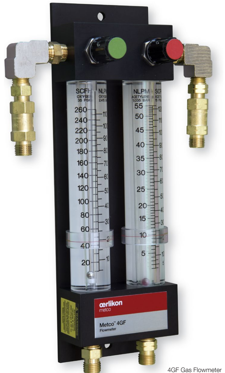
4GF Gas Flowmeter