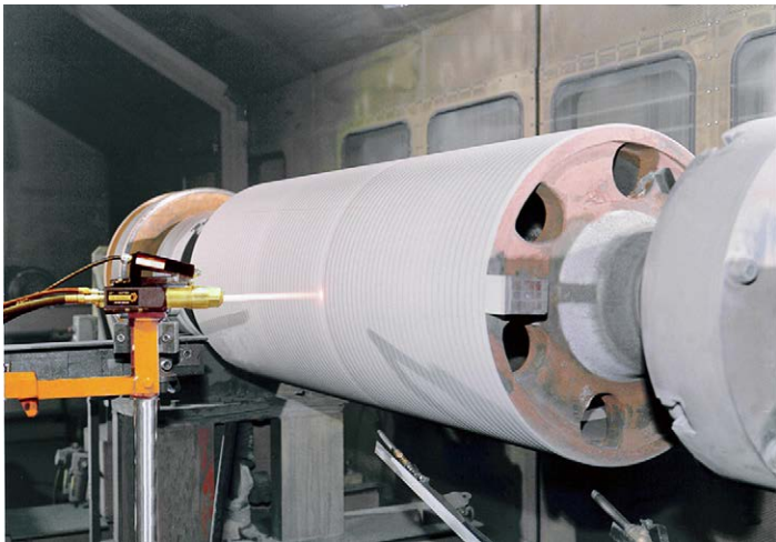
Coating a sink roll using a high-velocity oxy-fuel (HVOF) spray

Metco STEEL SR for sink rolls used in continuous galvanizing lines: